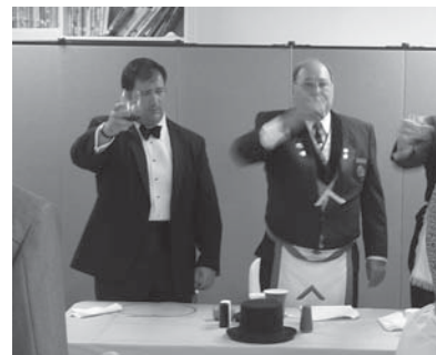
Table Lodge at Builder's Lodge #60 on September 19, 2007 Toasting With Primed Cannons