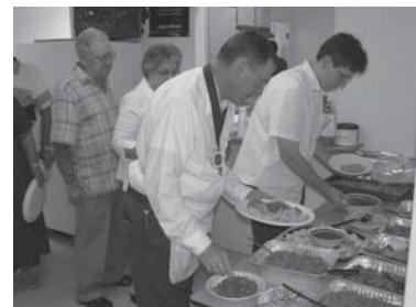
Table Lodge at Builder's Lodge #60 on September 19, 2007 Feasting